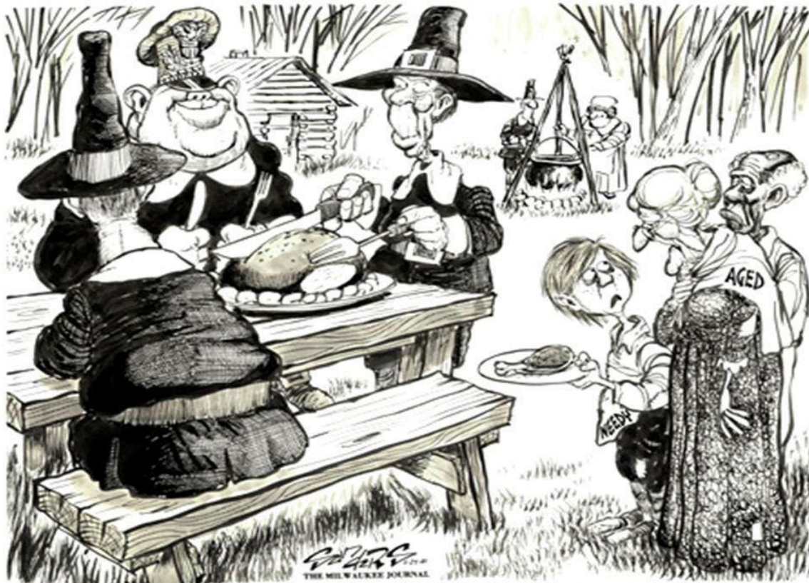
“I think this is called a trickle-down turkey!”

Context: “Reaganomics” had four main pillars: tax cuts, deregulation, decreased domestic spending, and reduction of inflation. Career political cartoonist Bill Sanders illustrated a response to this economic theory, also known as “trickle-down economics.”